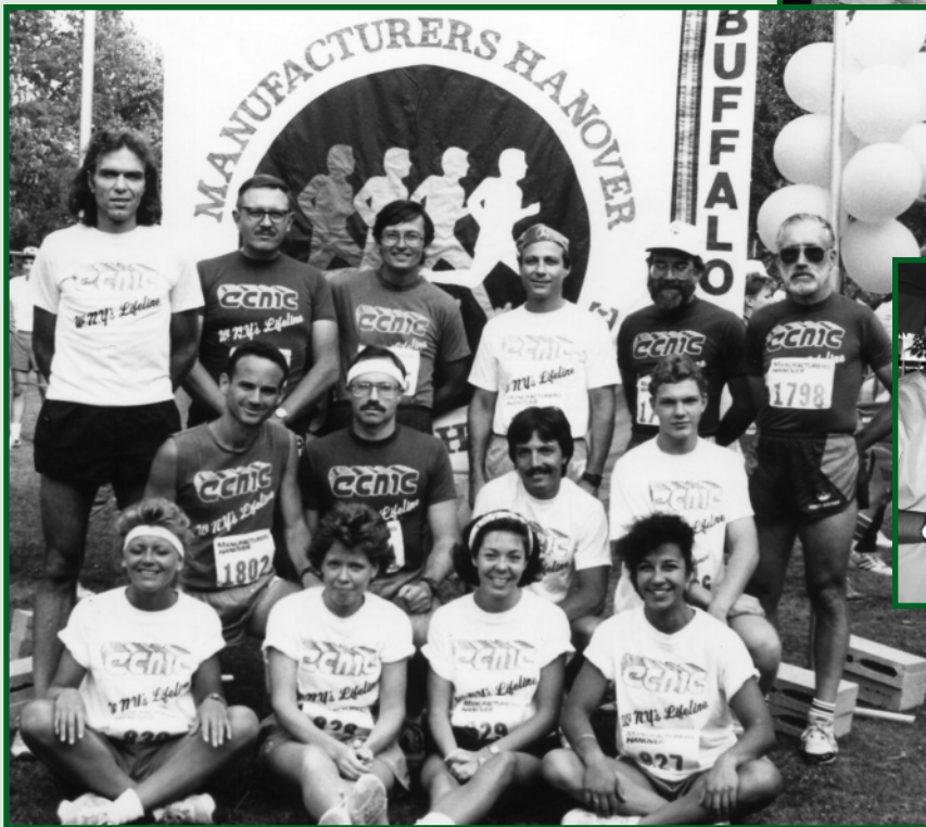
An early ECMC Corporate Challenge Team. Do you recognize any co-workers?

The largest ECMC team ever to participate in the JPMorgan Chase Corporate Challenge braved the hot and humid weather at Delaware Park on June 7, 2007. In a sea of light-green scrub shirts reading, "Everyone's Behind ECMC, Now You Are Too!" over 150 ECMC employees made their presence known in fine fashion. Many participants (even from other companies!) enjoyed the ECMC-branded water that participants handed out. Three hundred ECMC scrub shirts were also given away.